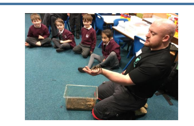
We learn through trips, visitors and special events.