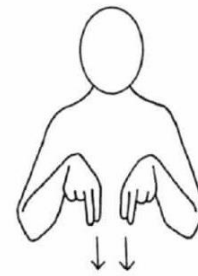
Small downward movement of hands

Makaton Sign of the Week - Among the many signs we have introduced this week, the children have decided their favourite has been the sign for puppy.